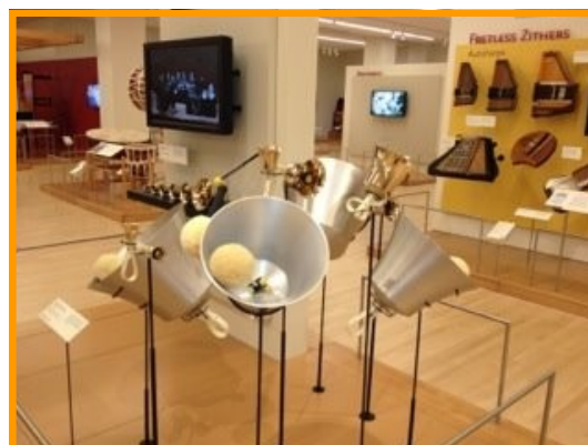
Museum Display - Story pg. 4

Be sure to keep your e-mail address up-to-date to receive the latest news.