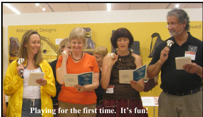
Playing for the first time. It's fun!

Then it was time for the volunteers from the audience to try their hand at ringing. Only folks who had never rung a bell before were allowed to participate in ringing "Take Me Out To The Ball Game." What fun it is to see the smiles on the faces of those who ring for the first time! Especially when they finally realize what they are supposed to do and it sounds better the second time.