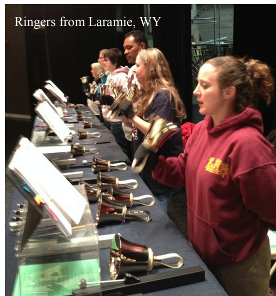
Ringers from Laramie, WY