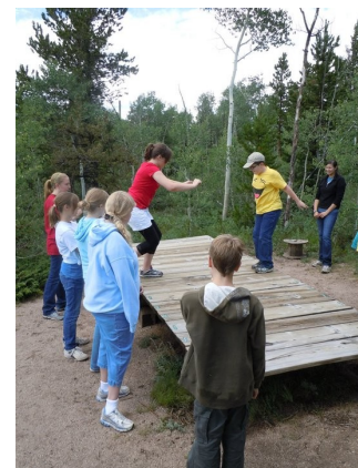
Blast from the Past! Pictures from Young Ringers Camp 2011 and 2013!