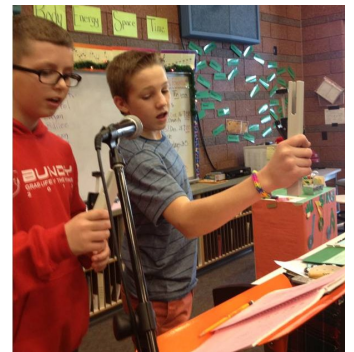
Students at Sunrise Ridge Intermediate School playing the handchimes during their enrichment class, Chime Time.