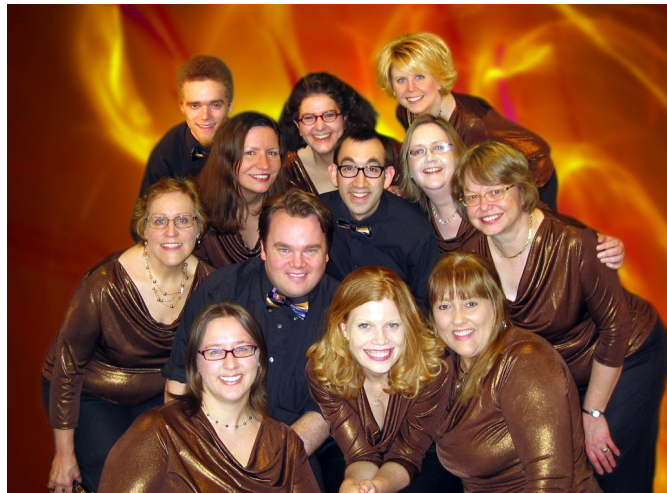
Twin Cities Bronze

Director - Ringing Up Tracks and Massed Choir